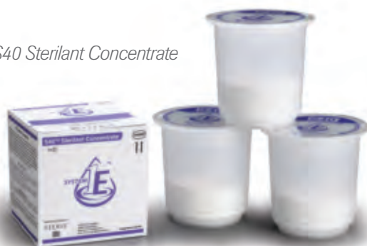
S40 Sterilant Concentrate

The use-dilution has a neutral pH, and rinses safely down the drain. SYSTEM 1E performs 2 quick rinse cycles, reducing energy and water consumption.