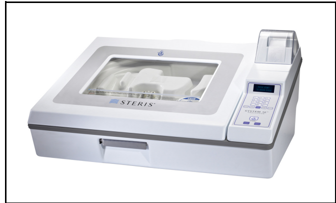
(Typical only - some details may vary.)